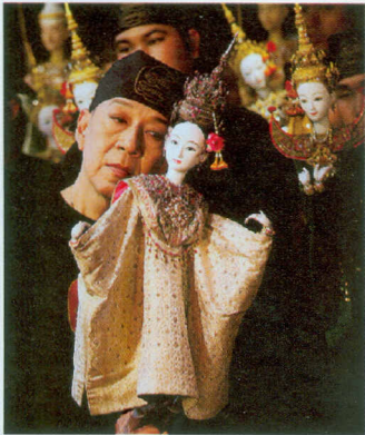
74 ART & CULTURE ASEAN puppet Festival 2017