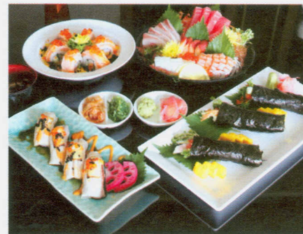
110 ASEAN CUISINE Mori Grill - Japanese Restaurant