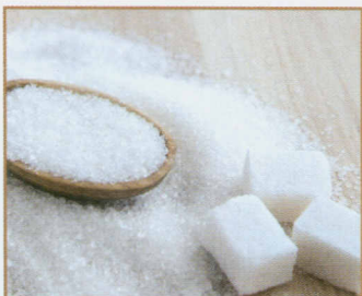
86 ESN SCIENCE SUGAR The Sweet Addiction that is more Harmful than Helpful