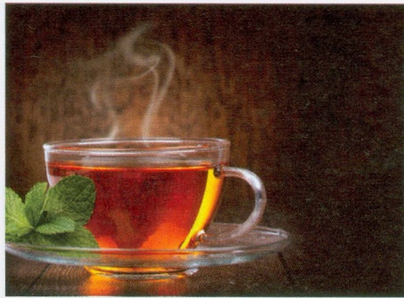
90 HEALTH CARE Benefits of Tea for Health and Skin