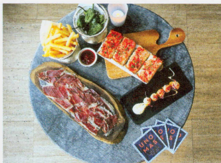
102 ASEAN CUISINE UNO MAS - The Art of Cuisine is Secret