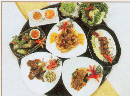
98 ASEAN CUISINE Le Danang - Original Vietnamese Cuisine