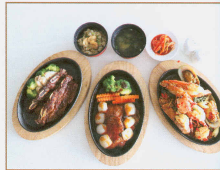
106 ASEAN CUISINE The Terrace @72 Restaurant