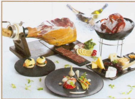
94 ASEAN CUISINE Lavie - Creative French Cuisine