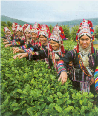
80 TRAVEL & LEISURE Let's get cool and stay in ozone @ Top 5 Tea Plantation Attractions in North of Thailand